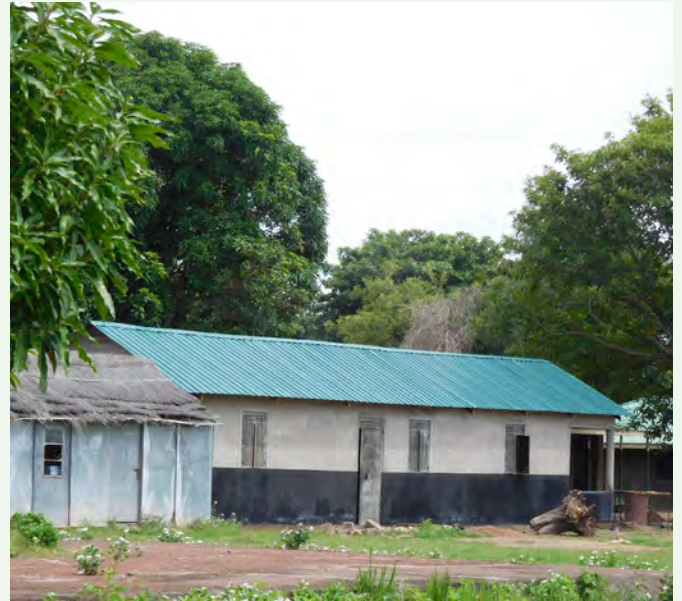
New storage facilities at Comboni Secondary School