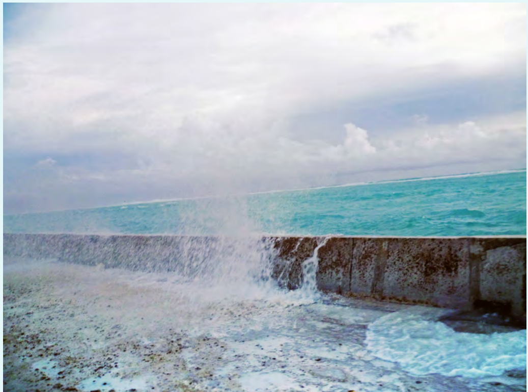
Flooding over seawall