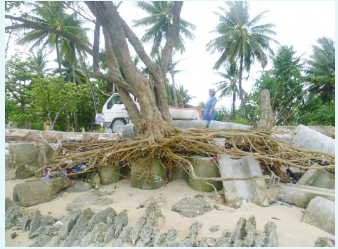
A tree needing support after erosion