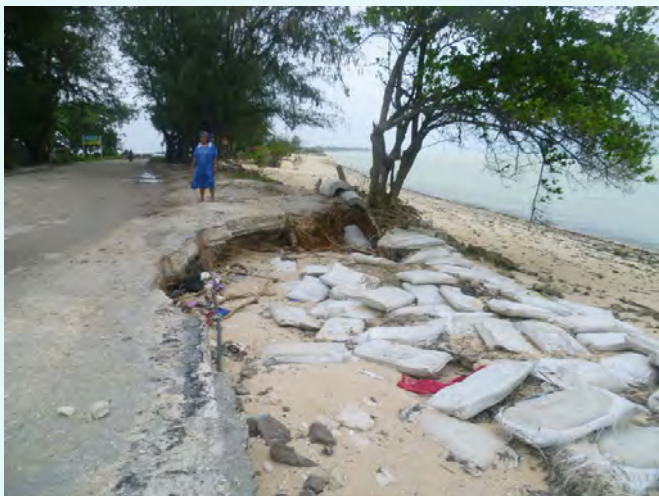
Roads are damaged after storms