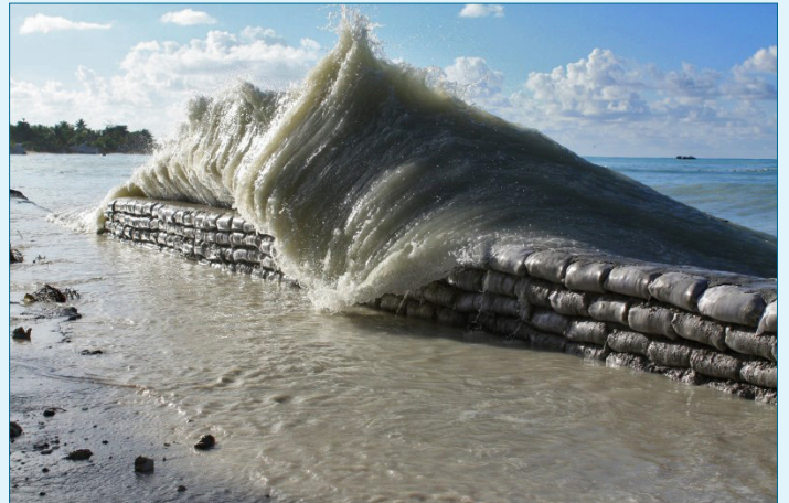
Waves flood over the existing retaining walls

The ongoing Empowering Women Project aims to educate women in Kiribati so they will have qualifications useful in other countries if and when they need to emigrate.