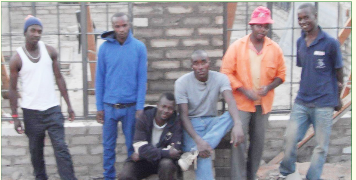
Ametur Project building team