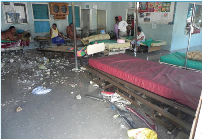
Flooded maternity ward