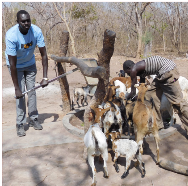
These goats love the water point too!