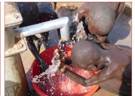
The joy of plenty of water at a new water point