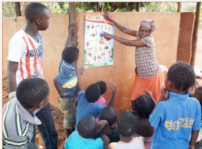
A caregiver at the Drop in Centre uses the ALphabet Chart to also promote nutritional values.