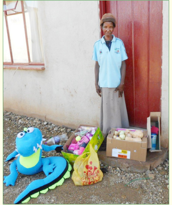
A hamper delivered to a family

Orphans and vulnerable children struggle to remain in school when there is no income for uniforms, books, stationery, tuition, transport or daily necessities of life. OLSH Overseas Aid helps these young ones to stay focused on their studies by providing homes and school essentials.