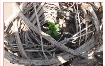
Seedlings prosper with water and a strong barrier