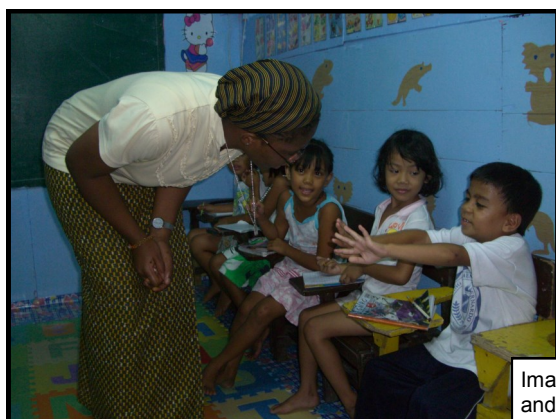
Images of the 2011 Matantubig Nutrition and Tutorial Programs