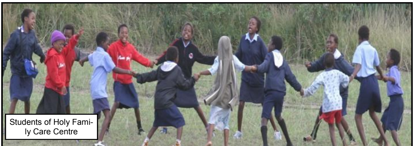
Students of Holy Family Care Centre