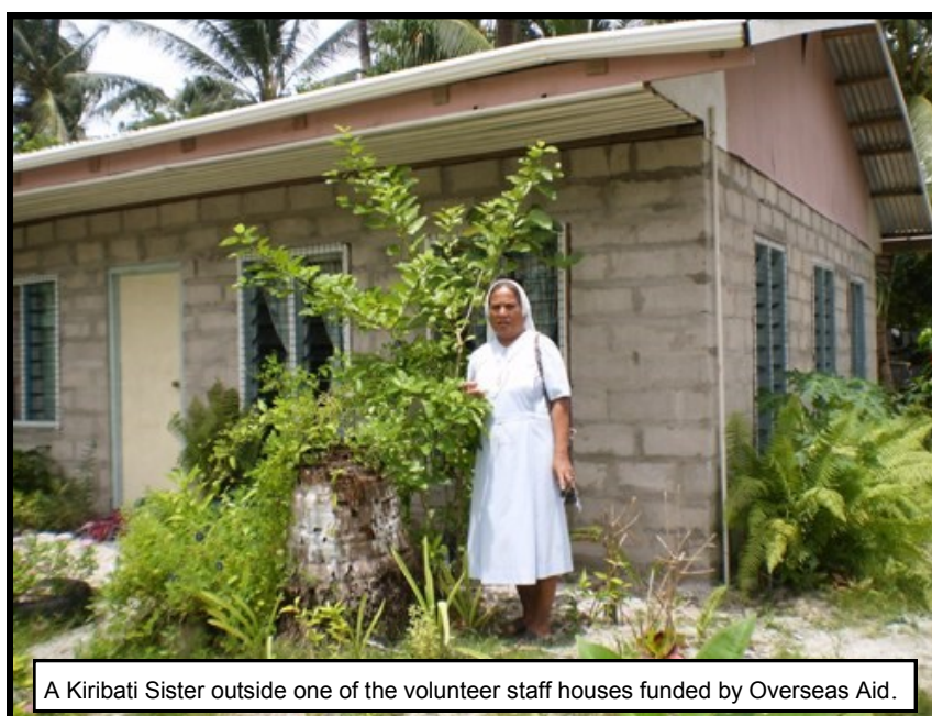
A Kiribati Sister outside one of the volunteer staff houses funded by Overseas Aid.

One very generous Overseas Aid donor enabled this important project to be funded in 2011. Women and children affected by violence in the home were given refuge. Our financial support provided infrastructure: bathrooms, laundry, toilets, storeroom, storage cupboards. A table, chairs, cradles, mattresses, sleeping equipment, clothes and food were provided, as well as computer equipment and internet access. Solar panels for night-time outdoor security lighting were installed.