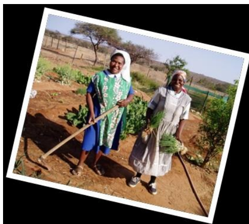
OLSH Sisters working in South Afri-

In this way we aim to create a greater solidarity with and empowerment of the local people by the sharing of our resources for their betterment and ultimate self-sufficiency.