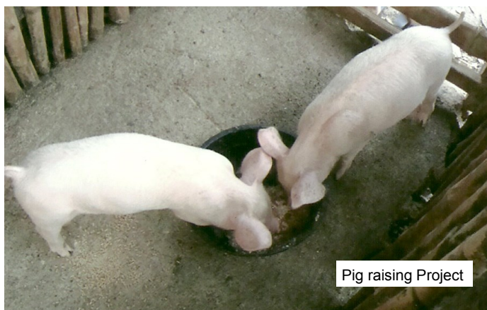
Pig raising Project

Selected vulnerable families on Bantayan and Malapascua Islands were provided with piglets, specialized pig food and nutritional supplements, and supplies for building breeding sheds. The families raise the pigs, selling some while retaining enough to enable their small business to grow. One donor in particular has been very active in promoting these projects.