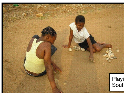
Playing jacks in South Africa

Daughter of OLSH—OLSH Provincial Council