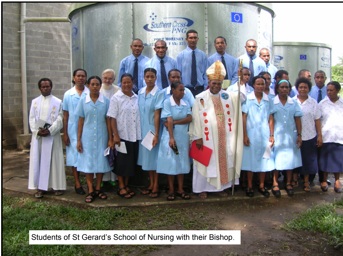
Students of St Gerard's School of Nursing with their Bishop.

Many rural people in the southern region of PNG who are affected by HIV/AIDS rely on Ametur House which opened in Port Moresby in 2007 to help care for families affected by the virus. The previous source of funding—the Clinton Foundation—had stopped due to a change of focus and in 2011 OLSH Overseas Aid was able to contribute to keep the facility running.