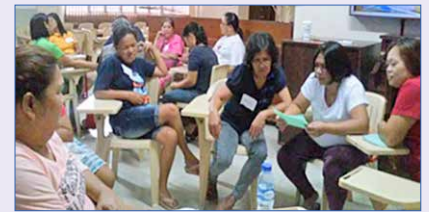
Parenting Session with mothers