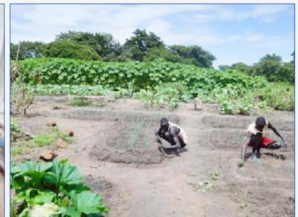
Women gardening in South Sudan

Rising Tides at Kiribati - During April 2017 homes were affected by the rising ocean tides. It is heart breaking to see the situation of these people in our local communities. Currently we have eight families and six large communities on our waiting list for assistance. We assist the neediest first, which is, most of the time very difficult to decide.