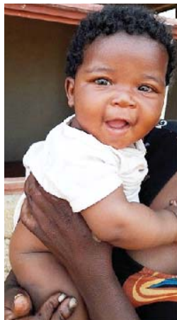
Baby from the village