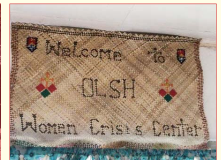
Banner made by the women