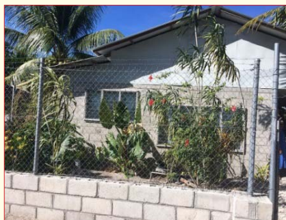
Outpatient registration area.

The OLSH Crisis Centre now fills the need for accommodation for women and children who have suffered abuse. Further development, such as separate accommodation for the children, is planned to cater for their future needs. For privacy reasons we do not publish photos of these members of the community.