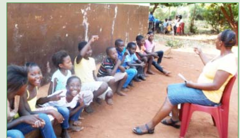
Children's after school program

At the orphan drop-in Centre, open every week day, children come for after school activities. The two groups here are with carers who check their homework, personal hygiene, health, play games, have quizzes and help the children to prepare items for entertainment.