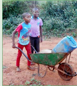
Bringing water from the creek

The Sisters keep all orphaned children in school uniforms, compulsory even in rural South Africa, so they are not turned away from class. Thanks to the donations, from the OLSH Overseas Aid Fund in Australia, these keen students are provided with the essentials needed to begin a happy year at their local school.