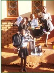
Essential school items