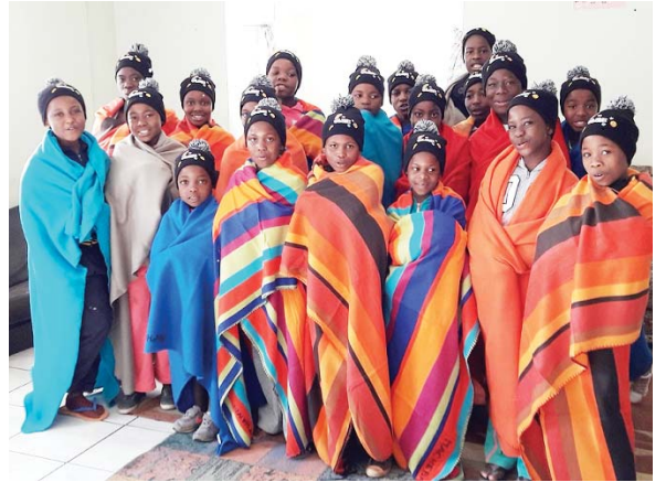
Girls from Bakhita Village

In most of the villages there is no electricity and no running water. The houses are built from scrap iron, wood or even cardboard. If they do not own the shack they have to pay rent to a landlord who can be unscrupulous. Those who are fortunate enough to reside at Bakhita Village have the advantage of being in a safe, secure and attractive environment and are well cared for by dedicated staff. This group of girls reside at Bakhita Village. As winter approached they were very happy to receive a colourful blanket each to keep them warm as they watched television in the evening or just spent time doing indoor school activities. Some of this same group of girls come from very poor homes in the surrounding villages.