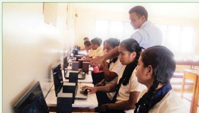
Updated computer room