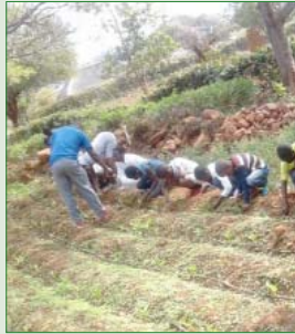
Planting in the field