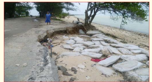
Damaged sea wall

During the high tide season families are unable to utilise their land for simple daily tasks as hanging washed clothes. By restoring the coastal areas for use the local family's normal routines can continue without the stress and fear of tidal changes that affect their way of life. Families, Communities and an Institute in the region have expressed their deep gratitude for our assistance.