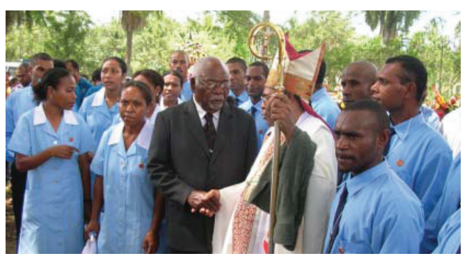
2010 Graduation- the Governor-General came for the ceremony – the first time a GG had been to the area.

At the training school, there are four street children we are looking after. They came from Port Moresby. We are trying to educate them so that they can look after themselves later on and do not turn to crime. The oldest boy, in grade six, won three prizes at the end of the school year. He tries so hard. The student health workers help him with his study. The youngest a girl is very bright. She has just started school this year. The two middle boys are not too interested in study. It is a constant job to keep encouraging them.