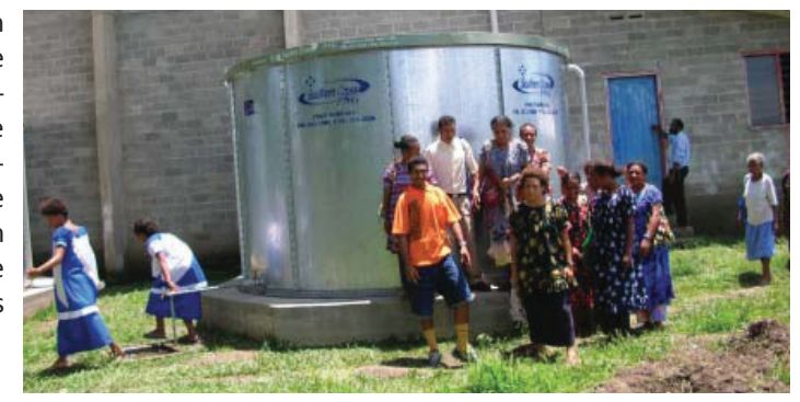
The new water tanks at St Paul's Parish Church at Veifa'a, four hours from Port Moresby.

eighteen Southern Cross Tanks in the villages. We want to put another eighteen tanks in, but are held up due to the floods in Brisbane. The steel comes from Brisbane for the tanks. A mine polluting the river and ground water is still operating and expanding. Since we have done the project phase one and two, we are having fewer people coming into the hospital. We are actually having empty beds in the hospital which is amazing. I have been working at Veifa'a for over twenty two years. We have been pushing hygiene all these years but with the project the people are much more conscious and taking steps to help themselves more which is good.